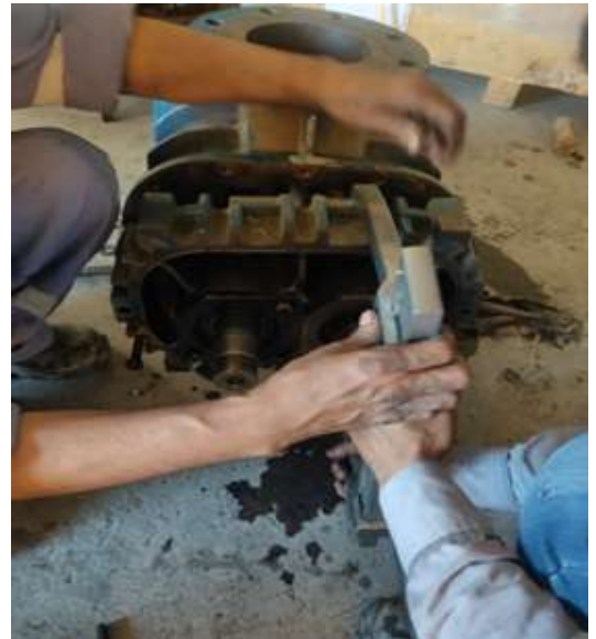
Dismantling vacuum blower