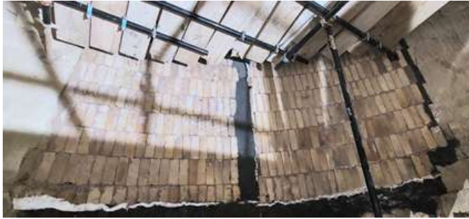
Cooler Bull Nose Anchor Welding