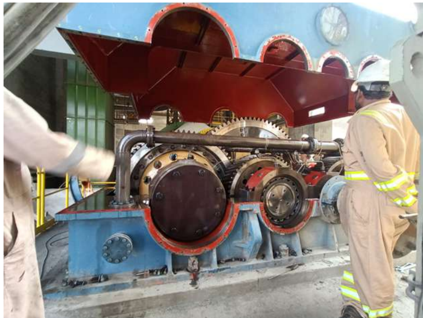
Deep inspection of gear box