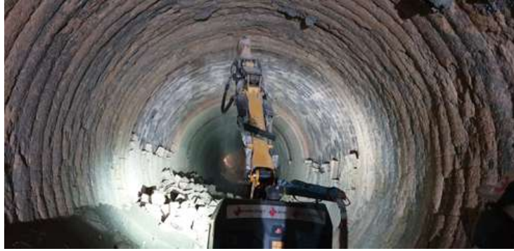
Bricks Lining Going On