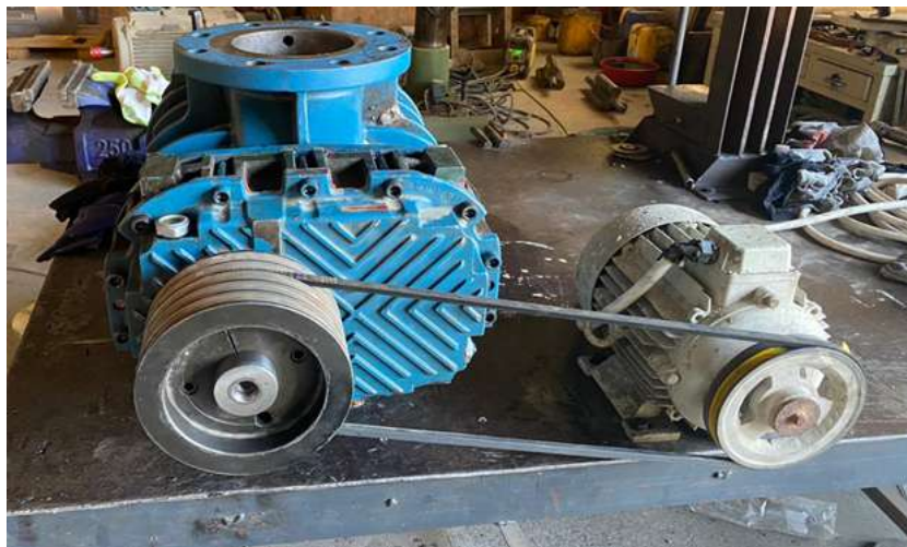
Take trail on no load