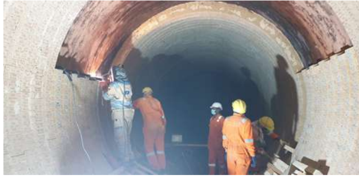
Bricks Lining Completed