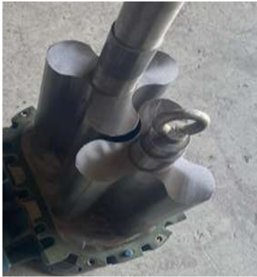
Assembling vacuum blower